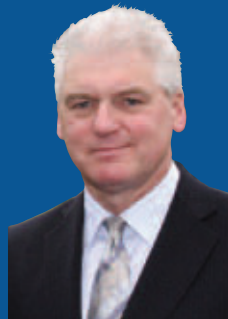
Ray Mallon, Elected Mayor of Middlesbrough